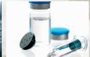
Caps made from Bromobutyl and Chlorobutyl protect medical products from external contamination.