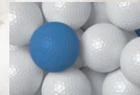
The high elasticity of Buna® CB helps golf balls travel further; its high reversion resistance keeps the balls in shape.