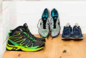
Levapren®, Krynac® and Buna® ensure good grip and low wear and tear in sports shoe soles.