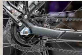
Low-maintenance and durable: drive belts made from Therban® keep e-bikes moving.