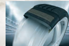
Optimized rolling resistance, excellent grip and long service life: Buna® and Butyl® ensure top performance from car tires.