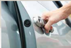
Keltan® Eco, the first EPDM rubber with up to 70% bio-based content, is used to manufacture products such as high-quality seals.